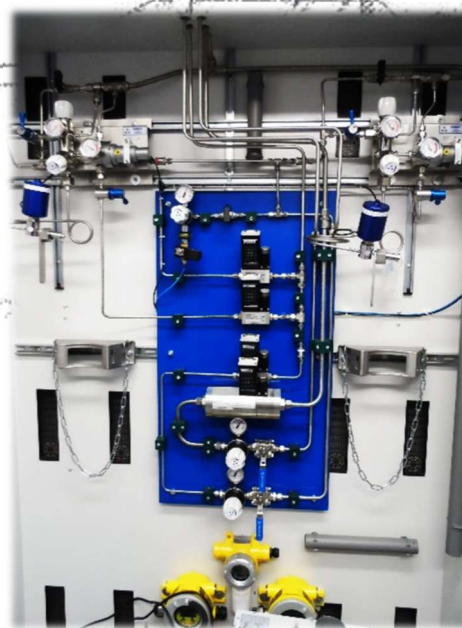
Gas mixing system for SO 2 -HCL-Ar