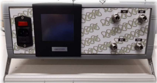
MIXBOX by Jadition - Gas Mixing "box"

Research and development of gas solutions