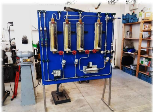
Heat treatment furnace - gas feeding system