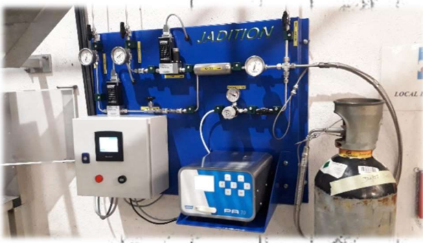
Gas mixing system with gas bottling option